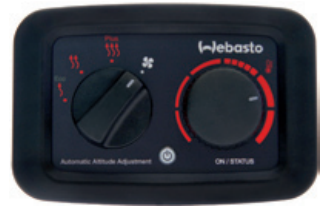
Evo multifunction control panel