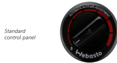
Standard control panel