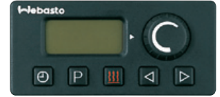
Digital control panel