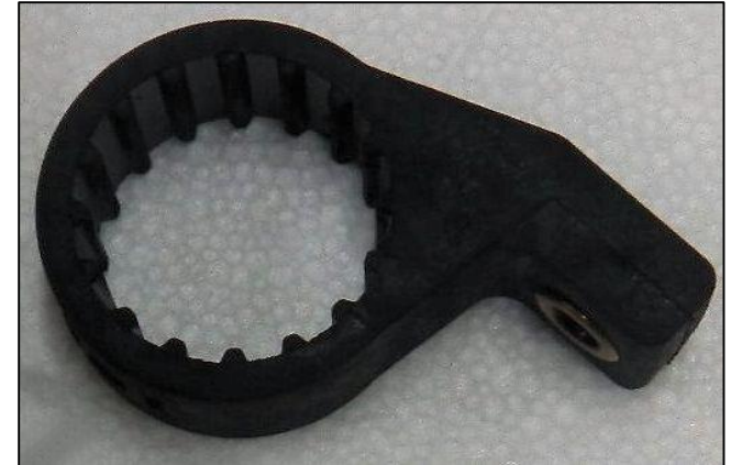
Rubber Mounting Bracket