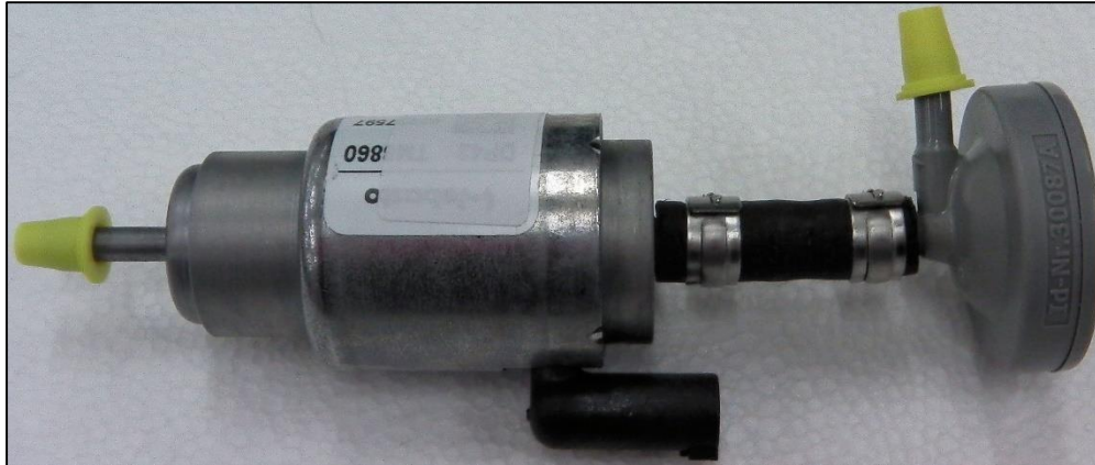
DP42 Fuel Pump