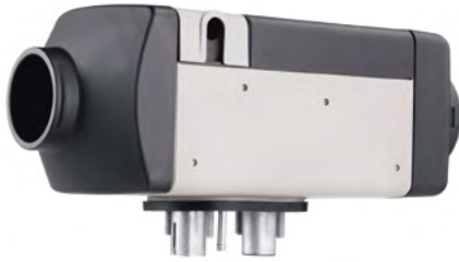
Air Top 2000 STC