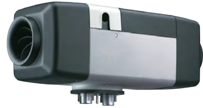
Air Top Evo 40 or 55