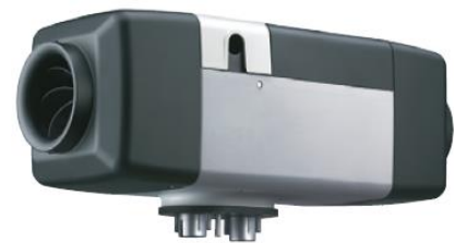
Air Top Evo 40 or 55