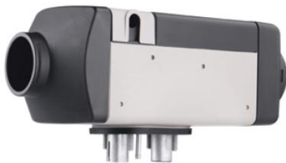
Air Top 2000 STC