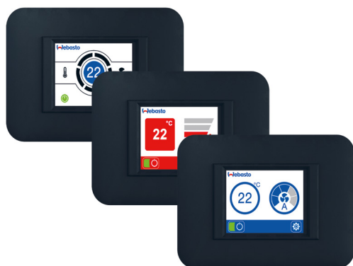
BlueCool MyTouch Display