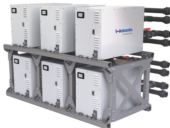
BlueCool V-PRO system