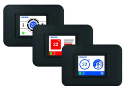
BlueCool MyTouch Display

* Based on 7 °C evaporating temperature and 38 °C condensing temperature