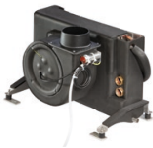
Compact air handler 4,000 BTU/h – 36,000 BTU/h