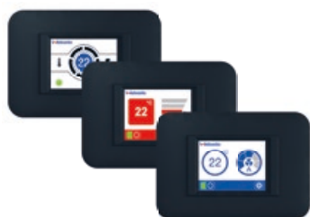
BlueCool MyTouch Display

The BlueCool MyTouch display is the new standard display for all BlueCool A/C Series: