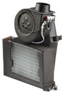
SlimLine air handler 6,000 BTU/h – 18,000 BTU/h