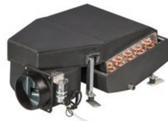
Low Profile air handler 6,000 BTU/h – 18,000 BTU/h

The central chiller unit is typically installed in the engine room, providing chilled water/glycol to all cabins via a water circuit. One or more air handler(s) in each cabin are fitted to generate the required cooling capacities individually in each room.