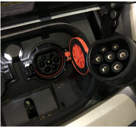
Charging cable with Type 2 plug